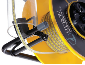
Figure 3 Hanger to support the meter at the well head. Tape Guide to protect the tape from sharp edges.

Item WLM Electronic Panel Thumb Screws (Set of 2)