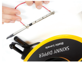
Figure 2 To Test the Entire System: Make sure sensitivity dial is turned fully clockwise. Touch one end of a conductive wire to the probe body and the other end to the last wire. This will create a short in the probe, the buzzer will sound if the system is okay.